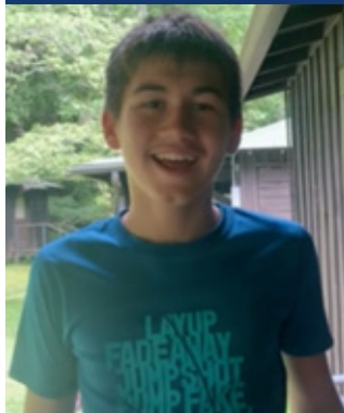
OPERATION PURPLE CAMPER AT CAMP WAHSEGA IN GEORGIA

“ The most fun activity here at Operation Purple Camp was the water games!”